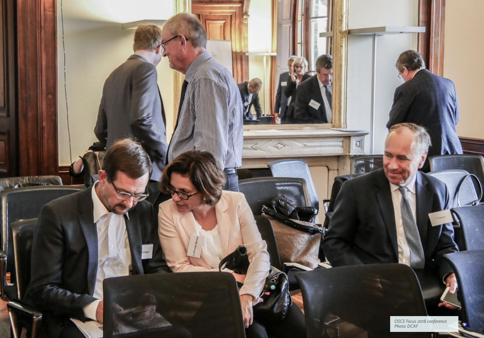
OSCE Focus 2018 conference

violations of core OSCE principles and norms remain unpunished; and the other that supports a pragmatic approach focusing on niches of cooperation and problem-solving where interests overlap to incrementally rebuild trust. In fact, participants felt that both approaches were required.