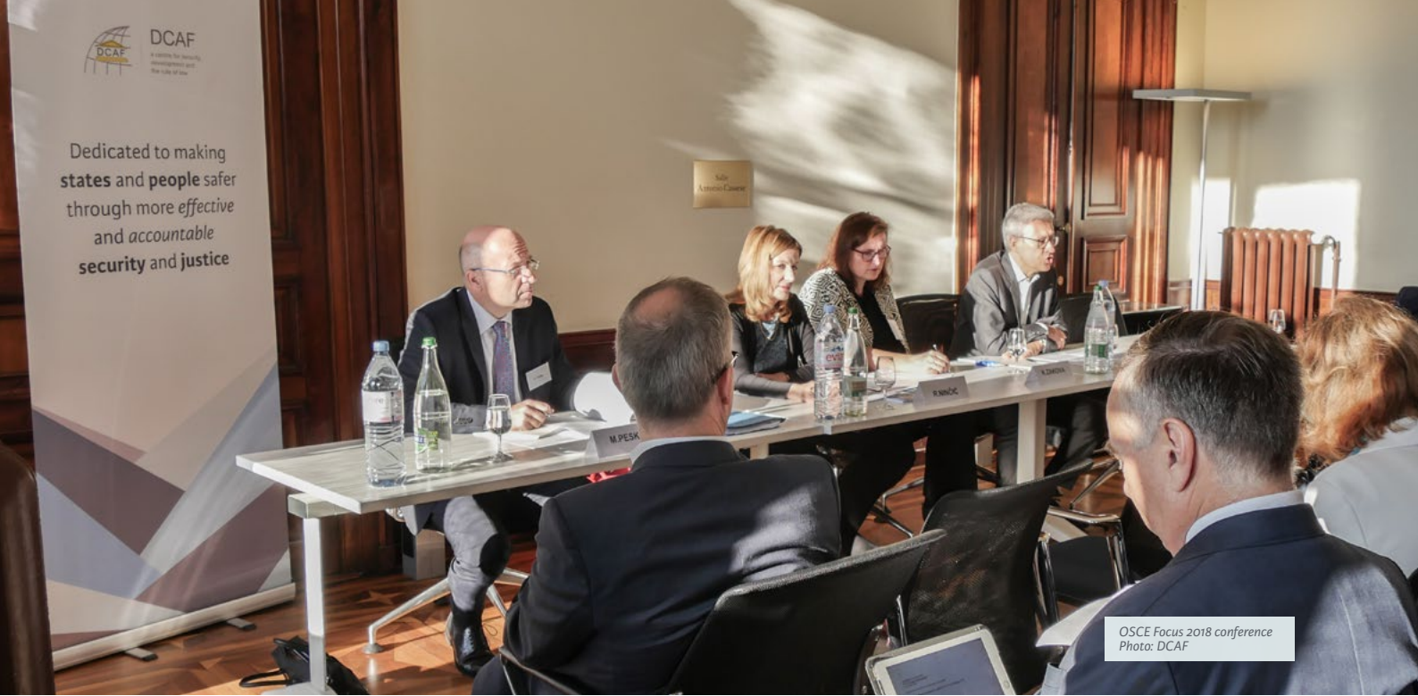
OSCE Focus 2018 conference