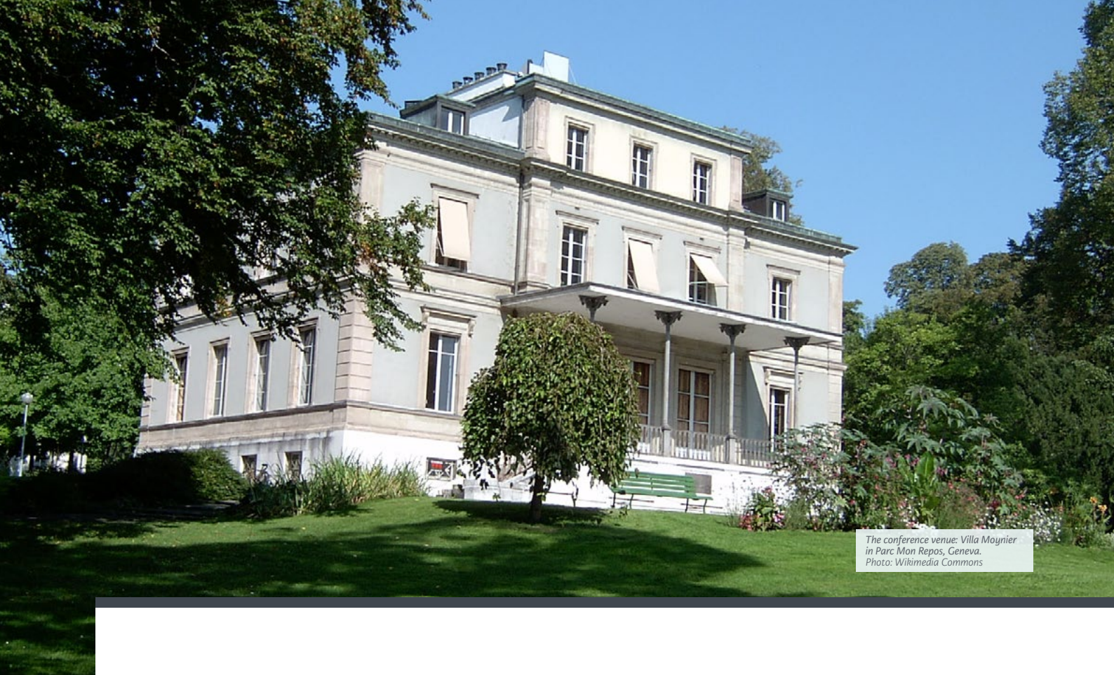
The conference venue: Villa Moynier in Parc Mon Repos, Geneva.

This report was prepared by the Center for Security Studies (CSS), ETH Zurich, and the Geneva Centre for the Democratic Control of Armed Forces (DCAF). The views expressed in this report do not necessarily represent the official positions of the ministries of foreign affairs of Austria, Italy, Slovakia or Switzerland, nor those of CSS, DCAF or any of the OSCE Focus 2018 conference participants. While the report summarizes the main themes, conclusions and recommendations of the conference, it does not provide a full account of the very rich and productive discussions held during the event. Instead, the report aims to highlight the main points of convergence and divergence among participants and to stimulate further work on European security and the role of the OSCE.