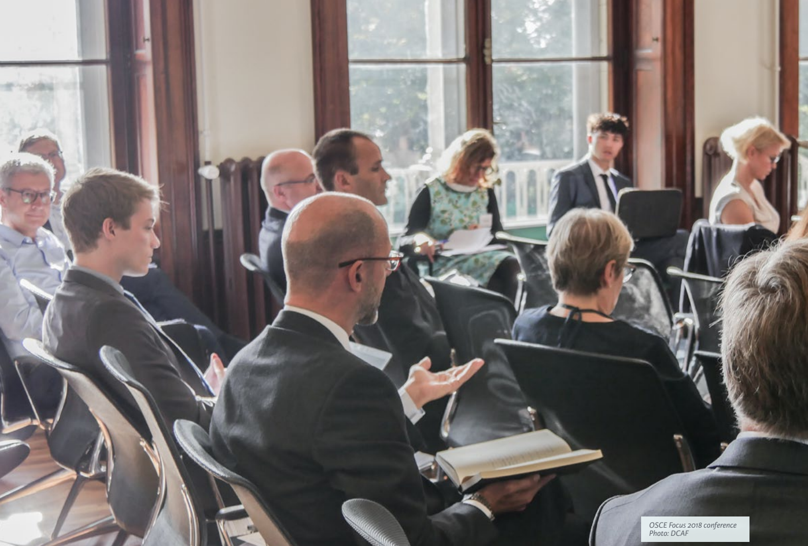
OSCE Focus 2018 conference

several suggestions on how HDIM could be reformed, drawing on ideas already discussed in 2012 during the Irish OSCE chairmanship. Participants made the following suggestions: moving the event from September to spring to allow more time between HDIM and the Ministerial Council and to avoid competing with the UN General Assembly in New York when attracting senior level officials; developing a fixed agenda (thus avoiding cumbersome negotiations on a specific agenda every year); shortening the two-week event to five days; asking participants to submit a synopsis of their speeches in the run-up of HDIM in order to check its relevance to the session and to restrict hate speech and so-called governmental non-governmental organizations (GONGO) groups at OSCE events; narrowing the focus of HDIM to the implementation of the OSCE's human dimension commitments; and re-emphasising OSCE's status as an organization of 57 states rather than a human rights organization.