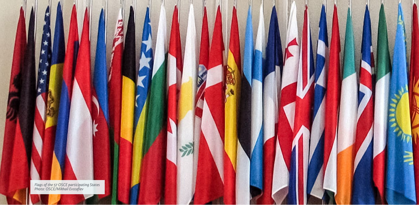
Flags of the 57 OSCE participating States