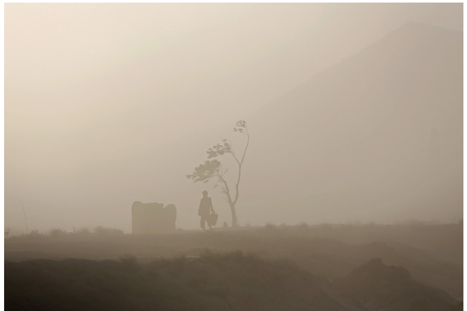
In 2015, jihadist forces in Afghanistan are on the rise. One year before the last US troops are about to leave, the prospects of the country seem bleak.

Far more significant than the fact of the Taliban chief's death was the duration for which it had been covered up by the insurgent leadership. Suspicions arose that Omar may have been assassinated by his deputy, Mullah Akhtar Mansoor. Mansoor, a narco-trafficker and a protégé of the Pa-