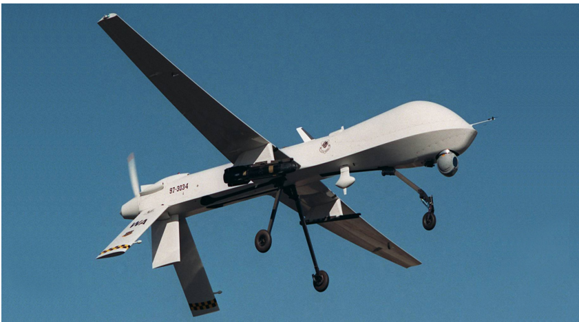
MQ-1 Predator drone armed with Hellfire missile

Drones have assumed a leading role in counterterrorism and counterinsurgency, and are projected to be of growing importance in future military operations. Their low cost makes them expendable and ideal for highly dangerous or politically sensitive missions. However, technical limitations as well as likely improvements in competing technologies, notably air defence systems, shall circumscribe the military role of drones. Although an integral part of future warfare, they are unlikely to fully replace manned aircraft and will instead, complement them.