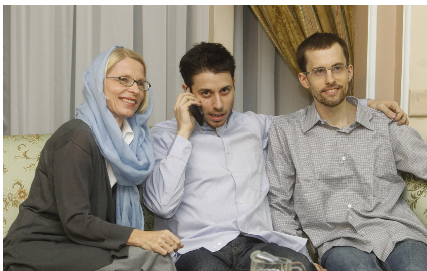
Swiss Ambassador to Tehran Livia Leu Agosti successfully lobbied for the release of US citizens Shane Bauer and Josh Fattal, who were being held in Iran. Tehran, 21 September 2011.

The importance of Switzerland's work as a protecting power, once a central element in its repertoire of good offices, has diminished. This general loss of significance contrasts with the great diplomatic relevance of individual mandates. One current example is the reciprocal representation of Russia's and Georgia's interests. A general trend reversal is not imminent, though. Switzerland should make use of advantageous opportunities without overestimating the strategic importance of protecting power activities for its foreign policy.