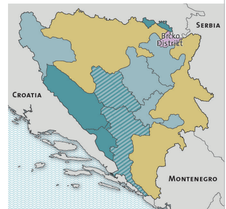
■ Republika Srpska ■ Federation of Bosnia-Herzegovina ■ majority Croat cantons ■ majority Bosniak cantons ■ ethnically mixed cantons Total population: 3,8 million (1991: 4,4 million)

The constitution of Bosnia-Herzegovina was introduced by the Dayton peace agreement , which ended the Bosnian War in December 1995. It stipulates a federalist state designed to prevent the largest population group, the Bosniaks (roughly 48 per cent today), from politically dominating the Serb (33 per cent) and Croat (about 15 per cent) minorities. The two smaller population groups had to accept the multi-ethnic state, but received varying degrees of autonomy rights. The central government only has limited jurisdiction in certain domains. The state presidency is held jointly by one Bosniak, one Serb, and one Croat. Moreover, the state is divided into two largely autonomous entities, the Federation of Bosnia and Herzegovina and the Republika Srpska (RS) as well as the Brčko district , which is de facto directly subordinate to the central government. The Federation, in turn, is subdivided into ten cantons that also enjoy far-reaching autonomy. A High Representative of the UN monitors the implementation of the Dayton agreement and holds extensive powers. An amendment to the constitution was already debated in the early 2000s. However, it could only be achieved with the agreement of all three population groups. No compromise has been reached so far.