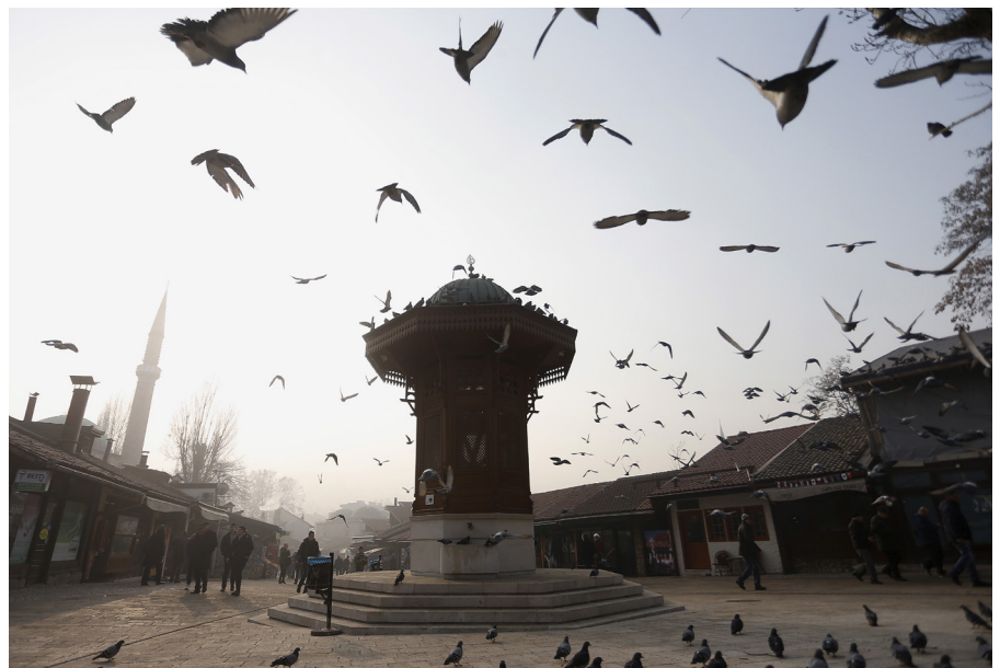
The structural deficits of Bosnia will not disappear for the time being. Two decades after the war, however, hopes in Sarajevo for a peaceful and better future are still alive.

The reason for the EU's stronger engagement is that the promise of sustainable economic advantages held out to the Bosnian people has lost credibility. For many years, Bosnia has been mired in deep crisis that has also eroded support for the path towards Western democracy. In 2010, 69 per cent of the population explicitly supported EU accession; by 2015, that number had declined to only 30 per cent. At the same time, Russia, Turkey, and a number of Arab countries have gained influence. Their investments have fewer strings attached. However, their respective relations are limited to specific regional constituent parts of the country, and as such contribute to deepening the entrenched ethnic divisions.