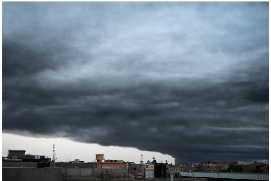
In spring 2016, black explosion smoke obscures the sky above Benghazi. However, the new unity government raises hopes for peace in Libya.

Implementing the political settlement will be far from straightforward, however. While the conflict has often been characterized as primarily one between Islamists and their opponents, it is considerably more complex. To be sure, ideology has been a mobilizing factor. However, the conflict has been driven by the competing interests of local groups that have been able to deploy violence for political gain and control over resources. The new GNA will