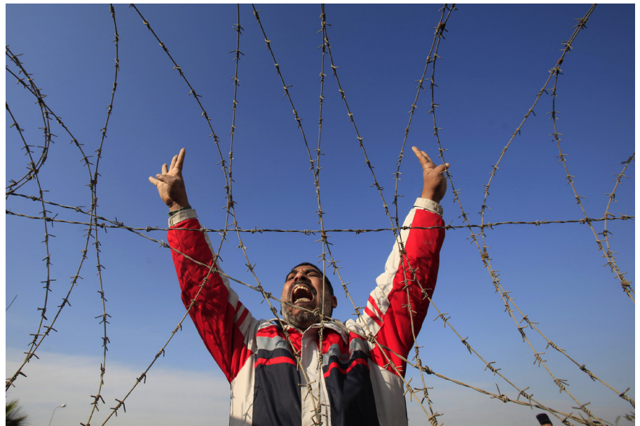
A supporter of the Muslim Brotherhood shouts slogans against the military during a protest in Cairo in January 2014.

Indeed, ties between Egypt and several Gulf States, especially Saudi Arabia, have