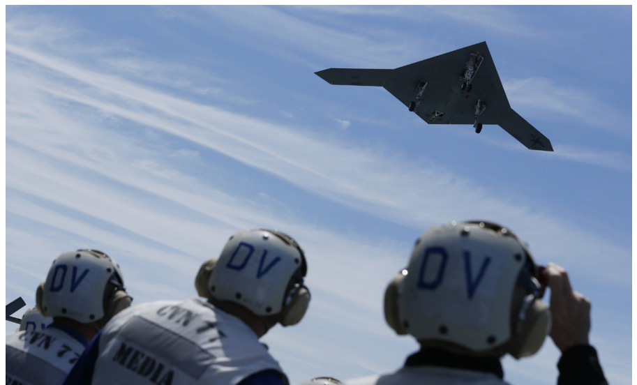
Unmanned armed drones indicate the potential dangers that future lethal autonomous weapons systems pose. The American X-47B operates already largely autonomously.

In May 2014, high-ranking international experts debated LAWS in the context of the UN Convention on Certain Conventional Weapons (CCW). It became clear