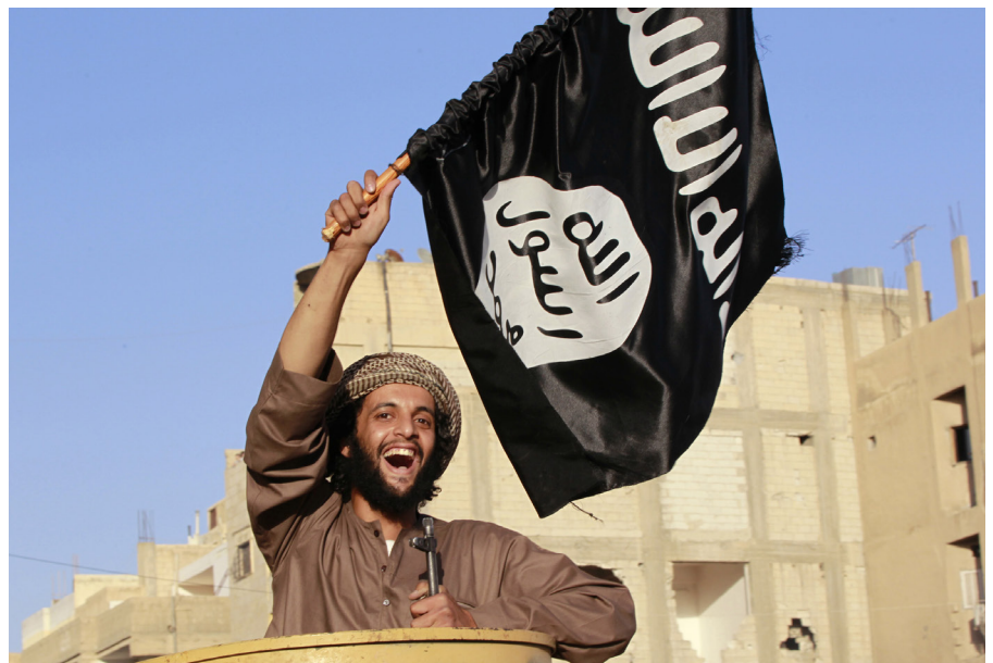
A militant Islamist fighter celebrates the declaration of an Islamic “caliphate” in Syria’s northern Raqqa province in June 2014.

The IS is unusual in that, until very recently, it had a record of impressive operational success, combined with a slick propaganda machinery to showcase this success. In contrast, al-Qaida remains weakened as a result of counterterrorism efforts in the Afghanistan-Pakistan region. Leaders of the older group are being upstaged by a new generation of jihadists with a more sectarian agenda that fits well with the political climate of some Arab countries reeling from the revolts of 2011. Al-Qaida now has competition from the IS in Libya and Syria, with possibly another front opening up in Algeria. Meanwhile, jihadist factions in Nigeria and Egypt have claimed alignment with the IS.