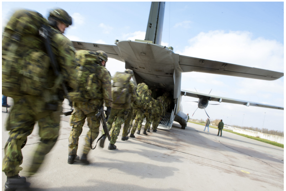
Czech Soldiers board a CASA C-295 transport aircraft during the VJTF Exercise "Noble Jump" at Pardubice Airfield, Czech Republic, 9 April 2015.

The result is a compromise that has so far avoided a decisive break with the 1997 NATO-Russia Founding Act and refrained from the permanent deployment of NATO forces on the territory of the eastern alliance members. NATO's ambitious "Readiness Action Plan" (RAP) thus foresees a rotation of units as part of a greatly expanded maneuver program in Eastern Europe, together with an eastward expansion of the alliance's hitherto rather embryonic command-and-control structure. However, most of the attention has been devoted to its new so-called "Spearhead Force", the Very High Readiness Joint Task Force (VJTF), which is to give the alliance the ability to react quickly to threats. While this force, too, must be seen in the context of an "Enhanced NATO Response Force (NRF)", its underlying concept makes explicit the nature of NA-