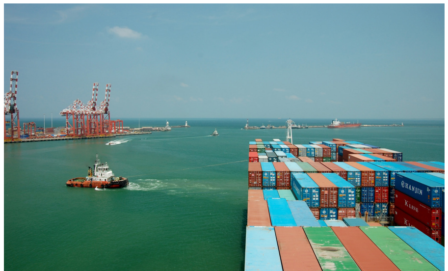
A $1.4 billion initiative to construct a port city in Colombo, Sri Lanka, is a crucial part of Beijing's One Belt, One Road strategy.

Invoking the historical imagery of the ancient Silk Road, OBOR envisions the construction of a set of grandiose infrastructural links that run from China to the rest of the world. The aim is to generate greater trade and enhance connectivity between China and Africa, Eurasia, Europe, the Middle East, and South and Southeast Asia. While a few sections of the New Silk Road are already in place or under construction, currently most only exist on the drawing board. Nonetheless, this vision of connectivity is beginning to catch the attention of the international community. Governments, businesses, and citizens that may lie along the proposed routes are attracted by the huge amount of finance that Beijing has suggested will be allocated and raised to make the vision a reality. At the same time,