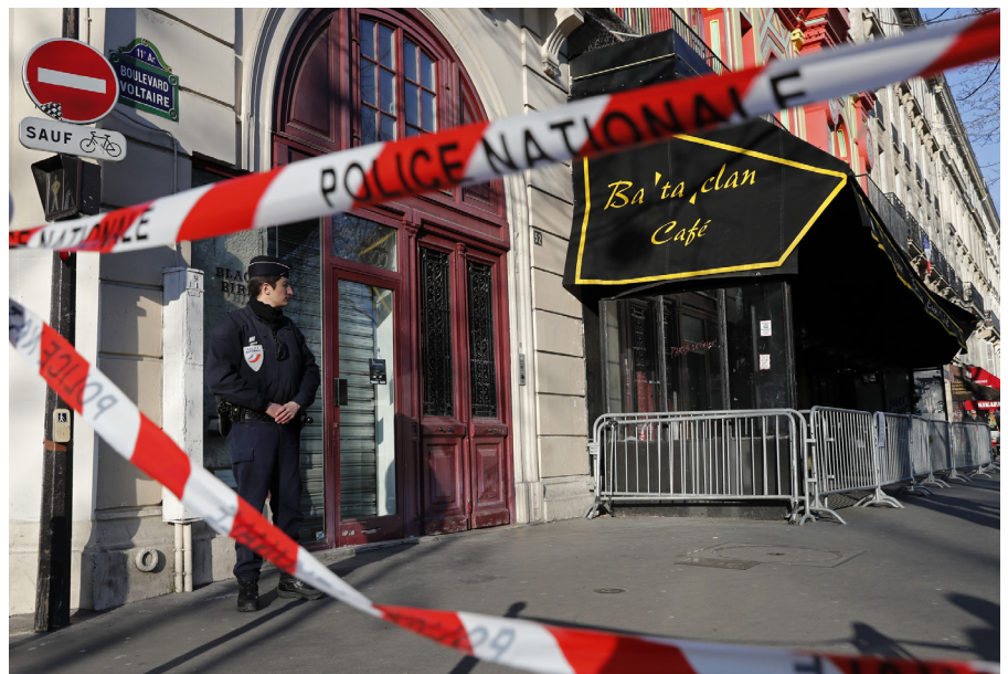
The terrorist attacks in Paris and Brussels between 2014 and 2016 illustrated the dangers emanating from returning foreign fighters for Switzerland.

The majority of these fighters come from Arab countries with particularly large numbers hailing from Tunisia and Saudi Arabia. However, since 2011, also 5,000–7,000 jihadist fighters from Western countries have gone to Syria and Iraq, including more than 900 from France, approximately 760 from the United Kingdom, 760 from Germany and 470 from Belgium. These figures are mostly estimates. In addition, different data collection methods make a cross-comparison between countries difficult. Hence, the numbers should be treated with caution. They can, however, be used to assess the extent of the phenomenon. The picture that emerges