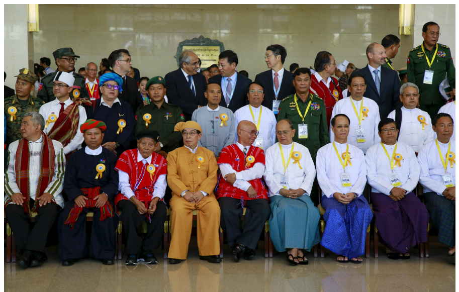
Government officials, ethnic rebel groups and international witnesses pose after the signing ceremony of the Nationwide Ceasefire Agreement (NCA) in Myanmar, October 15, 2015.

The characteristics of ceasefires vary between conflicts, but also within one and the same conflict. In Syria, local ceasefires offered some temporary respite to the beleaguered population in some areas. Yet in other situations in the same country they were used as part of a military strategy, implying surrender of one side and potentially