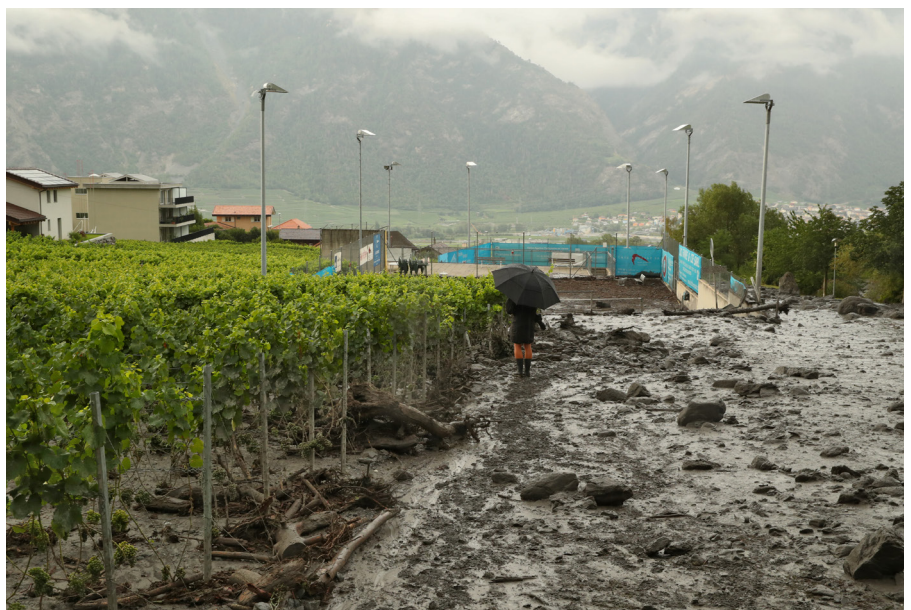
Mud in a vineyard next to the Losentze river after a flash flood in Chamoson, Switzerland in August 2019.

In Switzerland, the annual average temperature has increased by nearly 2 degrees Celsius since the pre-industrial era – almost twice as much as the average global temperature increase. Other important consequences of climate change are the changes in frequency, intensity, and variability of extreme weather events. The CH2018 Climate Scenarios for Switzerland produced by the Swiss National Centre for Climate Services (NCCS) indicate likely climatic changes under various conditions by 2060 and by the end of the century respectively.