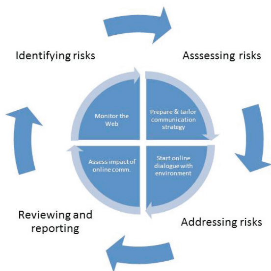
Figure 1: Integration of online risk communication into risk management cycle