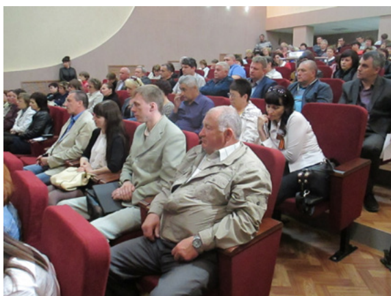
Debate in Tatischevo.

Analyzing these debates, it is hard to imagine that in small cities people believe politicians more than in big cities and that the politicians are going to take active part in Russia's political life. My boss once said, "If you put these events into perspective, it turns out that in a small city there were candidates, who have never been there before, know nothing about local problems, and are being seen for the first time, but United Russia tries to convince the people to vote for one of them." It became apparent that some candidates browsed materials about such cities during their trip there: "Well, where are we going... and what does Wikipedia say about this place?"