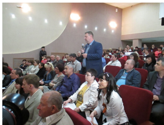
Debate in Tatischevo.