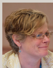
Alice Bullard Initiative for the Resurgent Abolition Movement - USA