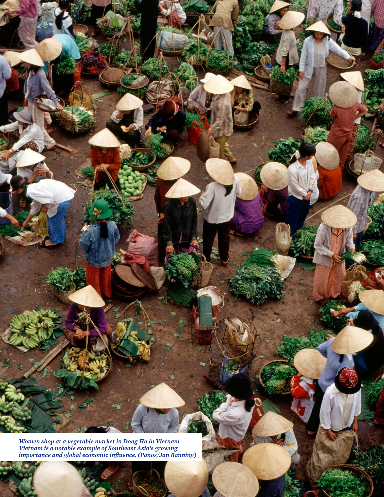
Women shop at a vegetable market in Dong Ha in Vietnam. Vietnam is a notable example of Southeast Asia's growing importance and global economic influence.