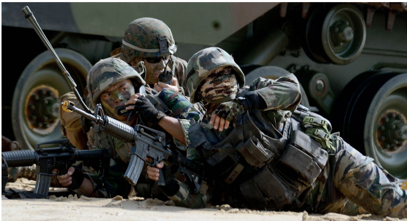
Given the resurgence of radical Islamist ideology, the United States and Southeast Asian partners should expand collaboration to counter transnational flows of terrorists and weapons. One such way is through Cooperation Afloat Readiness and Training, an annual bilateral exercise series between the United States and Southeast Asian nations to enhance maritime security and operational cooperation across a spectrum of contingencies.

Minister Malcolm Turnbull, “Obama described how he has watched Indonesia gradually move from a relaxed, syncretistic Islam to a more fundamentalist, unforgiving interpretation; large numbers of women, he observed, have now adopted the hijab, the Muslim head covering.” When Prime Minister Turnbull asked the president why this trend has taken root, Obama blamed the influx of Saudi and other Gulf Arab money and imams into the country; consequently, “[t]oday, Islam in Indonesia is much more Arab in orientation than it was when he lived there, he said.” 48