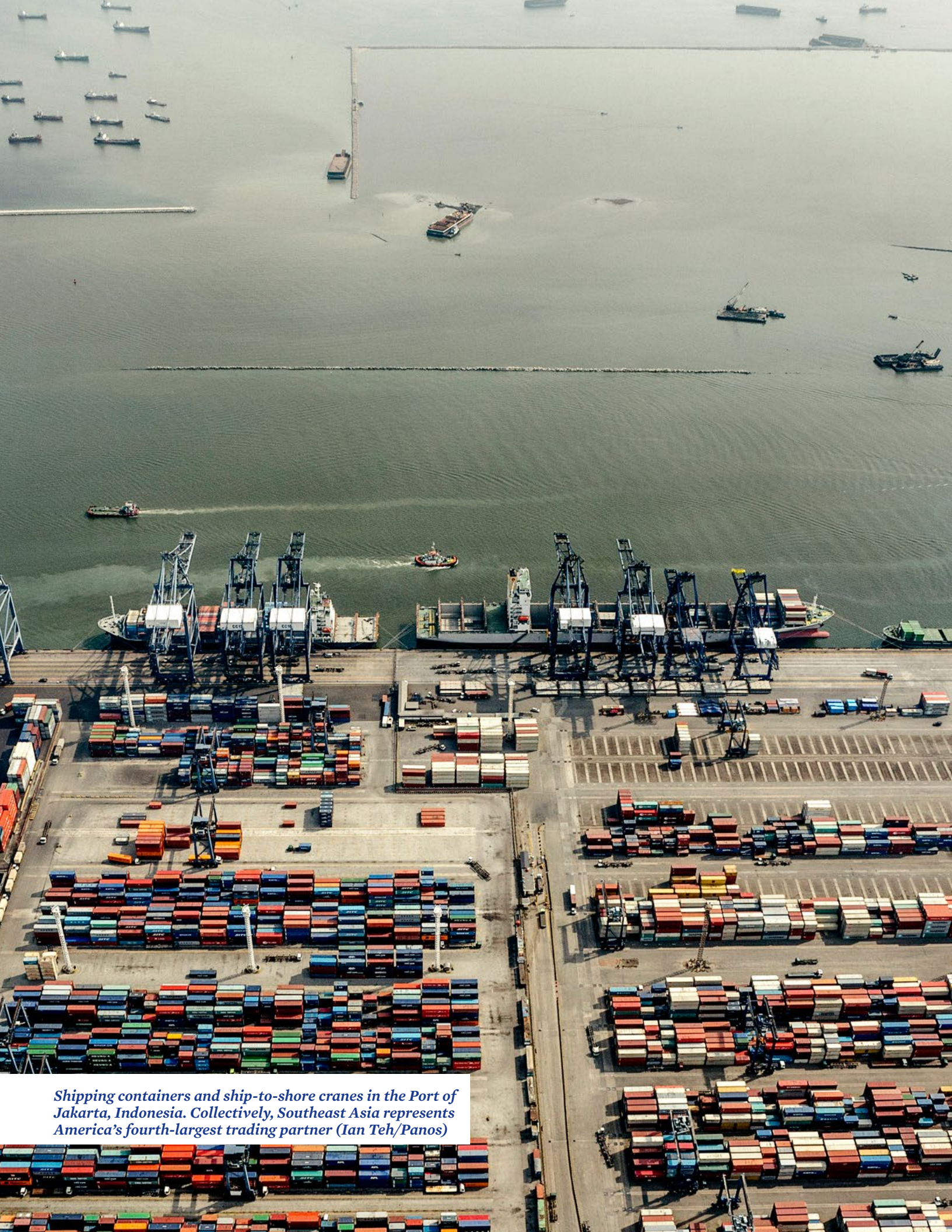
Shipping containers and ship-to-shore cranes in the Port of Jakarta, Indonesia. Collectively, Southeast Asia represents America's fourth-largest trading partner