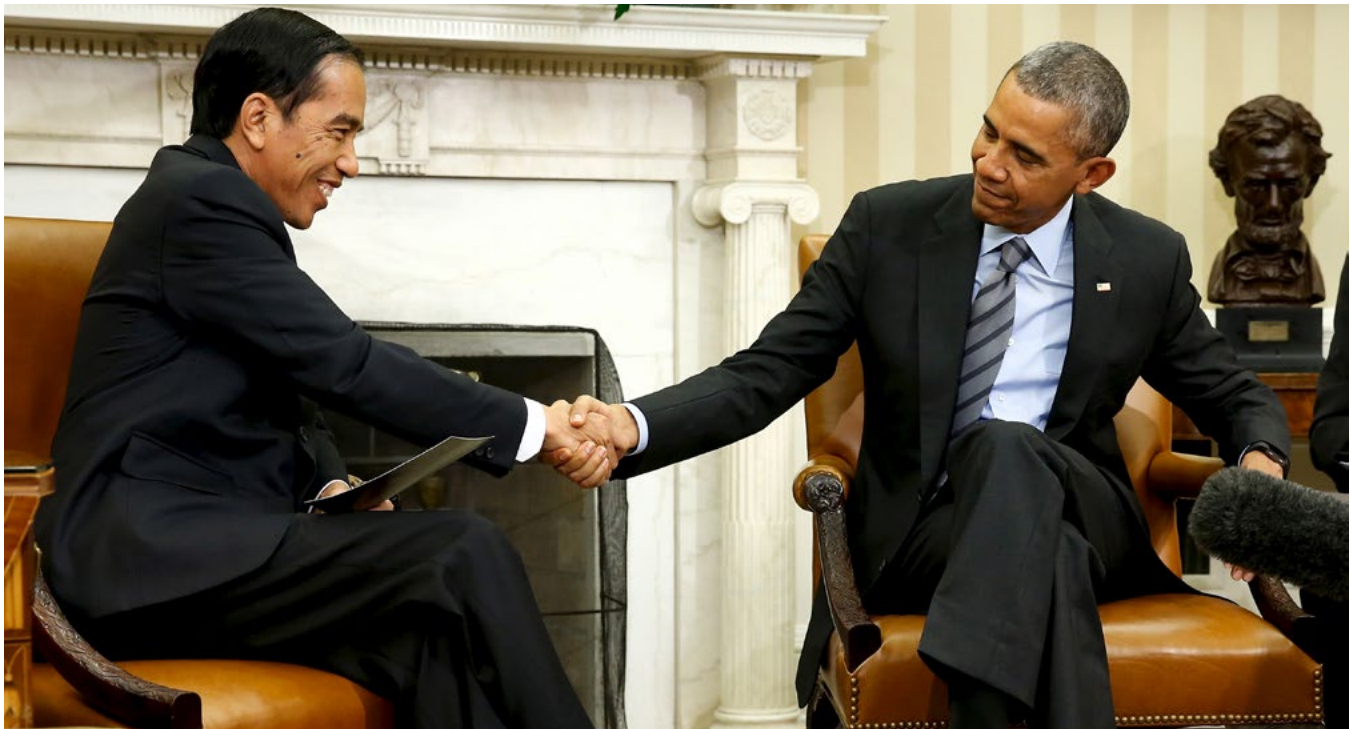
U.S. engagement with Southeast Asia has increased significantly under the Obama administration. Ties with ASEAN have strengthened, as evidenced by President Obama's attendance at the 2011 East Asia Summit, and U.S. bilateral relationships with countries in the region have expanded, as suggested by the new strategic partnership with Indonesia and the basing access agreement with the Philippines.

relations to new heights. Access and basing agreements have grown anew in Singapore and the Philippines, while U.S.-Indonesia and U.S.-Vietnam relations both established comprehensive partnerships before forging more strategic partnerships during the course of the Obama administration. The 2010 comprehensive partnership with Indonesia, the world's third largest democracy and 10th largest economy measured by purchasing power, was upgraded last October into an official strategic partnership to advance maritime security cooperation and other bilateral relations with the then-new administration of President Joko Widodo. 36 In July 2015, the United States and Vietnam agreed on a Joint Vision Statement during the historic visit by the general secretary of the Communist Party of Vietnam, during which both leaders highlighted mutual concern about the erosion of security in the South China Sea. 37 President Obama's visit to Vietnam in May will reinforce the enduring and strategic dimensions of U.S. relations with Vietnam.