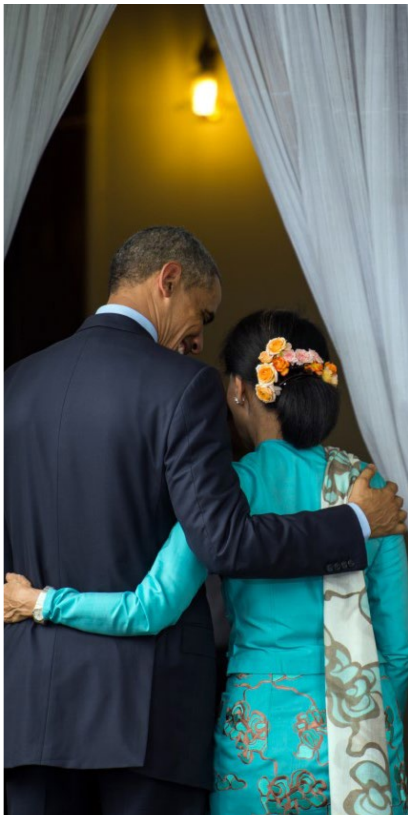
One of the Obama administration's most lauded achievements was the opening up of Myanmar, which has ushered Aung San Suu Kyi and her National League for Democracy Party into the corridors of power.

While Myanmar is a story of promise facing steep