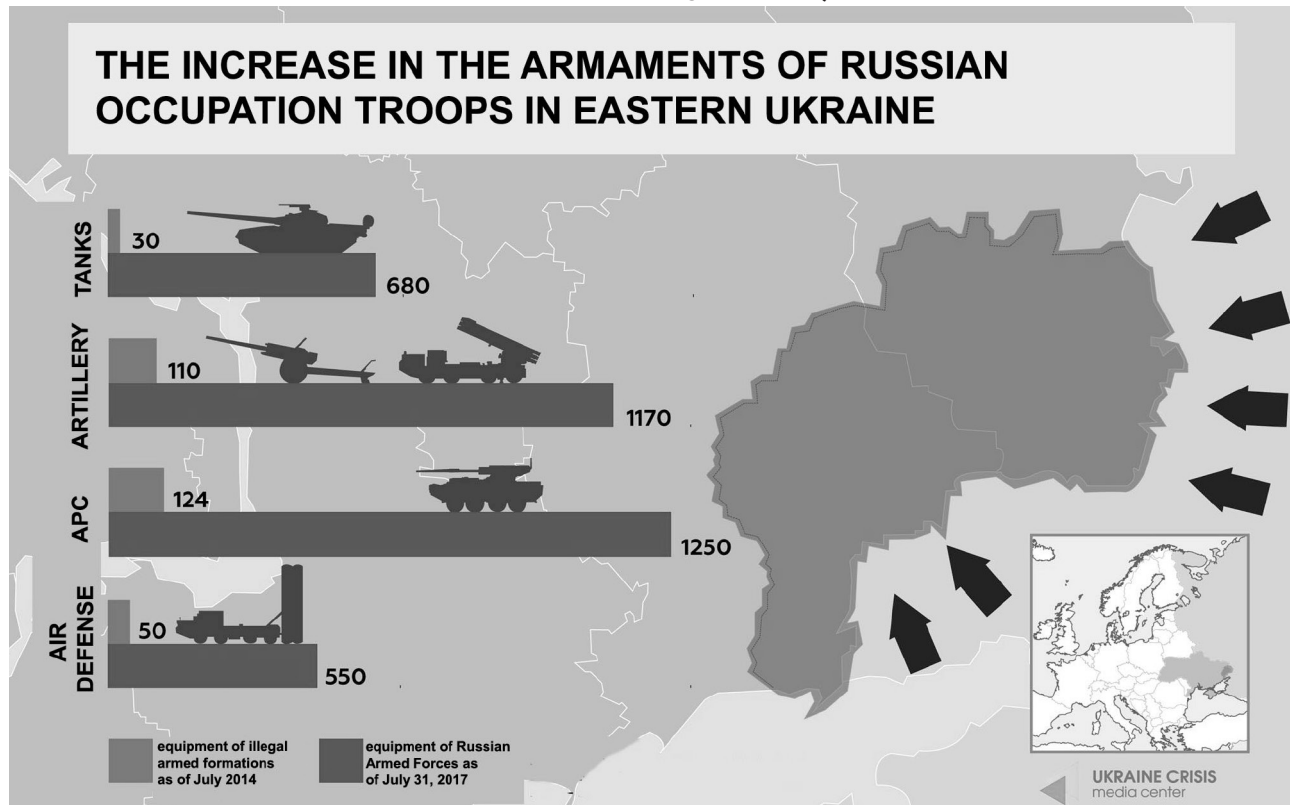
Figure 2. The increase in the armaments of Russian occupation troops in Eastern Ukraine (according to the Chief Directorate of Intelligence of the Ministry of Defence of Ukraine, as of August 2017) 52

Another possible consequence of the Law of Ukraine “On Special Order for Local Self-Governance in Certain Districts of Donetsk and Lugansk Oblasts” of September 16, 2014, is the unregulated interaction between the CDDLR “people’s militia” and Ukraine’s power ministries. One of the possible scenarios here is that the “people’s militia” would become the only power structure to operate in the CDDLR territories and, importantly, on the