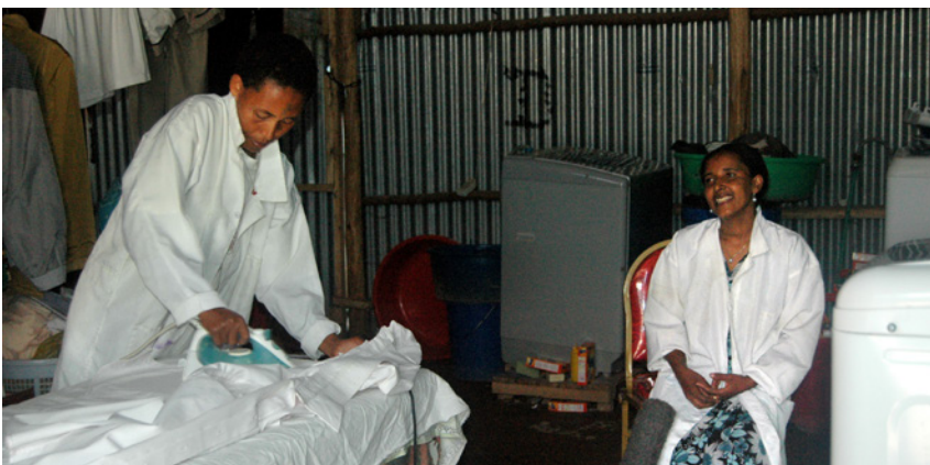
In a modest shack in Addis Ababa, a group of 55 women run a laundry, thanks to a project organised by the local organisation Beza with financial support from Sida.