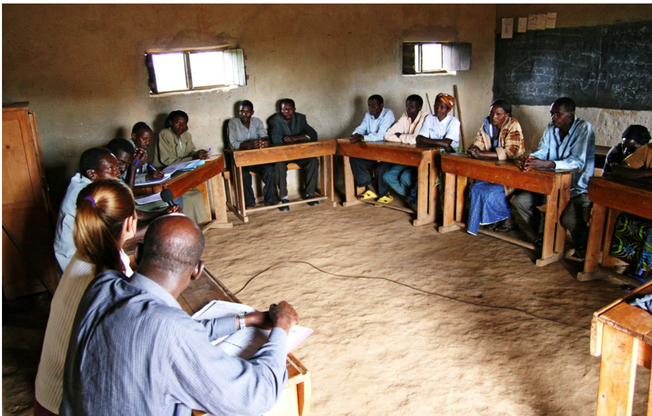
A so called dialogue club meeting in Kabagari, Rwanda. The Institute of Research and Dialogue for Peace created these clubs to help Rwandians confront their dark past and contribute to the reconciliation process.