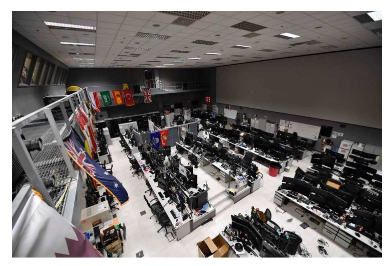
An empty Combined Air And Space Operations Center at Al Udeid Air Base on September 28, 2019.

Personnel at Shaw Air Force Base in South Carolina temporarily took over from the Combined Air Operations Center (CAOC) at Al Udeid in what amounts to a "dress rehearsal," but which some surmise may be a harbinger of the US pivoting away from the Mideast.<sup>2</sup>