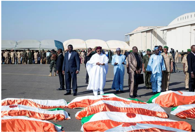
(Flag draped body of soldiers killed during a Jihadist attack in display in Niger in December 2019. )

On 1 February 2020, unidentified heavily armed men on motorbikes arrived in Lamdamol village in Seno province of Burkina Faso, north of the capital Ouagadougou and massacred 20 civilians . 1 The attack took place a week after a similar carnage in the province of Soum. Suspected Islamist terrorists had rounded up the villagers, executed the men and asked the women to leave the village. In early January, 36 people had been massacred at two villages in the northern Sanmatenga province. Jihadists also kidnapped and killed a Canadian mine worker and abducted two other humanitarian workers in December 2019. These incidents are the latest in a series of attacks that have taken place in this West African nation. A day before the 27 January attack, the prime minister of Burkina Faso and cabinet had resigned taking responsibility for the slide in security situation.