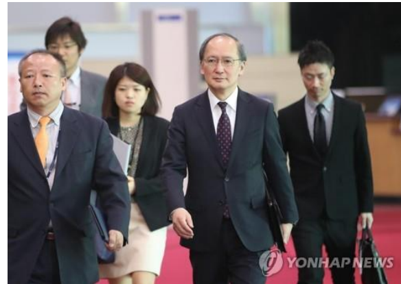
Japanese ambassador to South Korea, Nagamine Yasumasa, returns to Seoul.

With North Korea’s launch of another round of missiles on March 6, there initially appeared to be hope for a unifying front between the two sides. Yet, beyond phone talks between the foreign ministers on the same day, opportunities to improve bilateral relations were minimal. Conversely, another round of tit-for-tat exchanges resulted from the Japanese government’s complaint over South Korea’s proposed plan to conduct drills near Dokdo, which was followed by the South Korean Ministry of Foreign Affairs’ condemnation of Tokyo’s approval of high-school textbooks that portray Takeshima as Japanese territory. This was followed by another South Korean condemnation of Tokyo’s approval of courses of study for elementary and secondary schools that incorporate territorial claims over Dokdo/Takeshima.