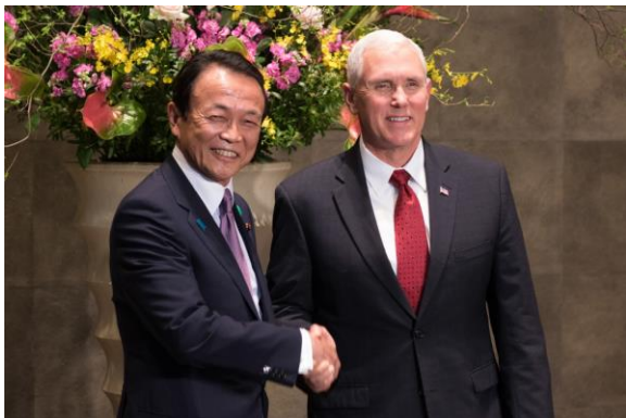
Pence and Aso in Tokyo

The transition to the new Trump administration was far smoother for Japan than for other US allies. Prime Minister Abe Shinzo's visit to Trump Tower the week after the election in November undoubtedly helped smooth the way, and his visit in February proved to be a successful confirmation of Tokyo's highest priorities for alliance cooperation. Secretary of Defense James Mattis and Secretary of State Rex Tillerson both headed to Northeast Asia, reassuring Tokyo and Seoul of the administration's commitment to its Asian allies. This early effort helped ensure continuity rather than disruption would be the theme for the US-Japan alliance for the next four years. North Korea, of course, helped that return to normalcy. Yet not all was settled in these early months. How the new administration was going to define its approach to trade remained ill-defined. The Japanese government, however, was not interested in a conversation that focused only on trade.