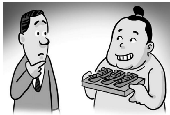
Global Times, 5 March 2017.

China continued to ridicule Japan's efforts to seek out allies. The imperial couple, who rarely travel abroad, visited Vietnam, paying homage to a patriotic fighter against French colonial rule who had close ties to Japan. Separately, in what a Global Times op-ed referred to as "dollar diplomacy," Prime Minister Abe offered generous official development assistance to Vietnam and the two countries agreed to strengthen cooperation on maritime law enforcement. Abe announced that Japan would provide six patrol boats to the Hanoi government. The Global Times' cartoonist limned a smiling sumo wrestler offering miniature ships on a sushi tray to a puzzled Vietnamese. Interestingly, although the Japanese was depicted in traditional sumo attire, the Vietnamese wore a Western business suit.