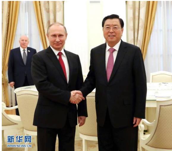
Putin and Zhang Gaoli. Photo by Xinhua, 12 April 2017.

Five days after Zhang Gaoli’s Moscow visit, China’s top legislative leader Zhang Dejiang was in town (April 18-20) for the third meeting of the Sino-Russian Parliamentary Cooperation Committee. Putin also met the second Zhang.