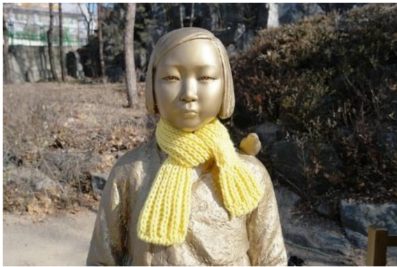
The “comfort woman” statue in Busan (Feb. 21, 2017)

With South Korean presidential election scheduled for May 9, the early months of 2017 witnessed not only avid campaigning by candidates, but also a deepening diplomatic conflict between Seoul and Tokyo. In particular, the installation of a “comfort woman” statue facing the Consulate General of Japan in Busan last December perturbed bilateral relations, calling into question the landmark “comfort women” agreement. While the anticipated installations of additional statues by provincial and civic actors risked escalating tensions further, the presidential candidates have made nominal efforts to quell the concerns of Japanese diplomats. As the Blue House prepares to greet its new occupant, prospects for a significant turnaround in bilateral relations remain uncertain.