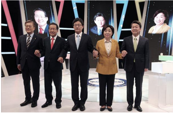
South Korea's presidential candidates at the latest TV debate

While the rapidly evolving security environment in Northeast Asia introduces greater uncertainty, and while a wide spectrum of policy issues ranging from GSOMIA to the “comfort women” agreement still requires proper resolution, come May 10, South Korea will at least again have its top executive. The summer months of 2017 should shed important light on the logic and trajectory of political developments between Seoul and Tokyo.