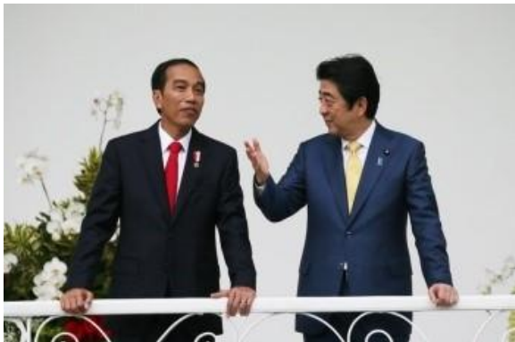
Japanese Prime Minister Shinzo Abe and Indonesian President Joko Widodo

In the meantime, Japan and key maritime states in Southeast Asia – Vietnam, the Philippines, Indonesia, and Malaysia – continue to pursue joint efforts in maritime capacity-building. Key “deliverables” in this area featured in Prime Minister Abe's visits to the region in January.