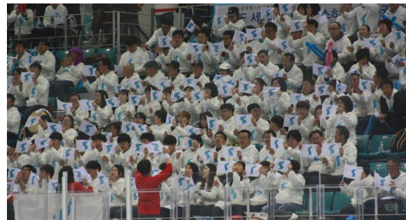
S.Korea wins 3-0 against North in Women's Ice Hockey match in South.

Yet it takes two to tango. As Seoul executes a U-turn to go back to the future with Sunshine 2.0, how will Pyongyang respond? Suh Hoon may have gotten to know Kim Jong Il, but that cuts little ice now. Kim's son and heir remains a largely unknown quantity, who has ramped up hostility while evincing scant interest in outreach to the South. Still, first indications look cautiously positive. On May 11, the day after Moon Jae-in took office, the Party daily Rodong Sinmun urged that “the two Koreas should respect each other and open a new chapter to move toward an improvement of their ties and inter-Korean unification.” But the devil is in the detail. The paper called for an end to “confrontational” policies: the South should end military exercises with the US and stop activists sending hostile leaflets across the DMZ. Both of these, especially the former, are longstanding Northern demands. They should, and hopefully will, be nonstarters unless the North makes some conciliatory moves of its own.