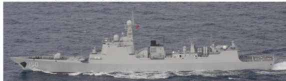
Luyang II-class missile destroyer (150) (MOD, 24 April)

One of three PLAN ships seen in Japanese water on 24 April 2017.