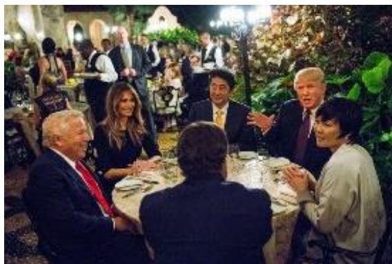
Trump and Abe

As one of the first foreign leaders to spend considerable time with President Trump, Abe seemed to tutor the new president on international diplomacy. The Florida retreat provided a far less formal setting, and Trump was minimally staffed. This scene would be repeated two months later when Xi Jinping arrived in the US, with a full entourage, for his first meeting with Trump.