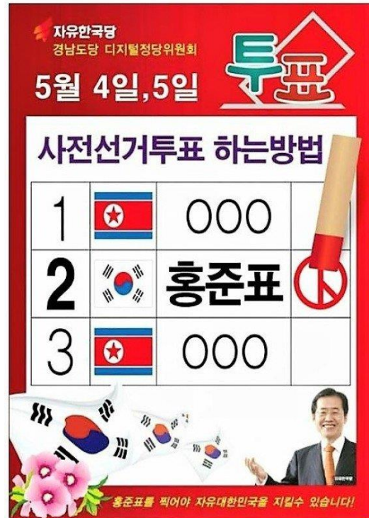
Campaign poster for conservative candidate Hong, suggesting that a vote for his main rivals (Moon or Ahn) is like voting for North Korea.

Right-wing backing for Ahn ebbed after the Liberty Korea Party (LKP) – as the conservative party Saenuri had renamed itself, to expunge the taint of Park Geun-hye – chose Hong Jun-pyo , a former party chairman and provincial governor, as its candidate. Hitherto seen as a maverick, Hong's hard line on everything from North Korea (no) and homosexuals (hell no) to capital punishment (bring it on) rallied South Korea's conservatives, unfazed by his past admission (which he sought to retract) of abetting a date-rape. Hong also did well in the five mandatory TV debates , whereas Ahn performed poorly. More specifically Hong proposed an “armed peace” on the peninsula, and the return of US tactical nuclear weapons to maintain it. Hong was the only candidate who came out firmly and unambiguously as pro-THAAD.