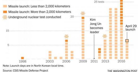
North Korea missile launches and nuclear tests

If Washington’s messages toward the DPRK have been mixed and at times contradictory, Pyongyang’s response has been disturbingly consistent, both in word and in deed. Missile launches of all types have accelerated (see chart for details) and the North’s most recent threat of a “super-mighty pre-emptive strike” now comes with video examples showing everything from a US aircraft carrier to Washington DC being vaporized by its “powerful nuclear deterrent.”