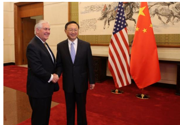
Tillerson and Yang

In mid-February, Secretary of State Tillerson and Foreign Minister Wang Yi met on the sidelines of the G20 Foreign Ministers Meeting in Bonn, Germany. The China Daily described the meeting – the first between high-level ministers from the US and China since Trump assumed office – as “upbeat.” Tillerson highlighted to Wang the increasing threat from North Korea, which had conducted its first ballistic missile of the year a week prior, and, according to the State Department readout, “urged China to use all available tools to moderate North Korea's destabilizing behavior.” Chinese coverage of the meeting devoted little attention to North Korea, choosing instead to emphasize Tillerson's reiteration of the Trump administration's commitment to the “one China” policy. A few days later, Tillerson stressed “the need to address the threat that North Korea poses to the region” in a phone call with State Councilor Yang Jiechi.