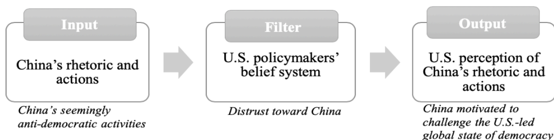
FIGURE 3. U.S. Perceptions of China’s Seemingly Anti-Democratic Activities

In recent years, distrust toward China has put the United States on the defensive, triggering a series of US actions against China’s activities in the United States. These US actions have aroused criticism from China and caused a self-reinforcing spiral of distrust between the two countries. For example, responding to tougher US scrutiny of Confucius Institutes (Chinese-funded education programs at the universities in the United States) in an attempt to shut down “the malign influence of foreign propaganda,” 21 Chinese Foreign Ministry spokesperson Lu Kang says the US intent to “politicize” the Institutes shows “a typical Cold War mindset” that “may reflect their lack of confidence.” 22 While the mutual distrust between the United States and China has not yet created a “security dilemma” bringing about an arms race as intense as in the Cold War, the spiral of distrust between the two countries will inevitably damage the bilateral relationship.