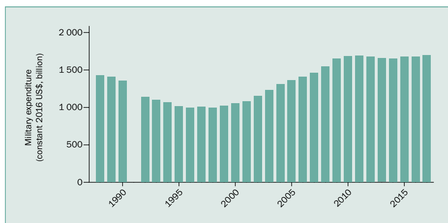
Figure 1. World military expenditure, 1988–2017

Note: The totals are based on the data on 172 states in the SIPRI Military Expenditure Database as of May 2018. The absence of data for the Soviet Union in 1991 means that no total can be calculated for that year.